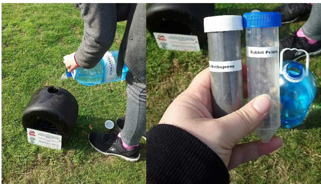
Figure 7a) filling tyre with aged water; b) S-methoprene and rabbit pellets

Refill the tyre with unused but aged water that is at least one week old (Figure 7a). In the laboratory or office, fill a 10 litres container with water and add two rabbit pellets or a handful of dry grass, leave the water to sit for a week and then use to refill the tyre traps. In the field add 2 S-methoprene pellets (Figure 7b).