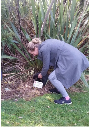
Figure 8) replacing the tyre back where it was found.

Replace the tyre and check the signage is still in place and readable (Figure 8).