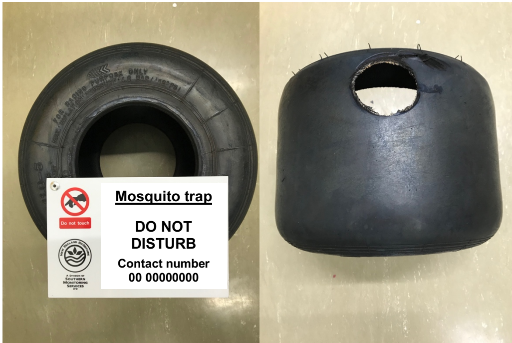
Figure 1a) Tyre trap with signage. b) Hole drilled to empty the content