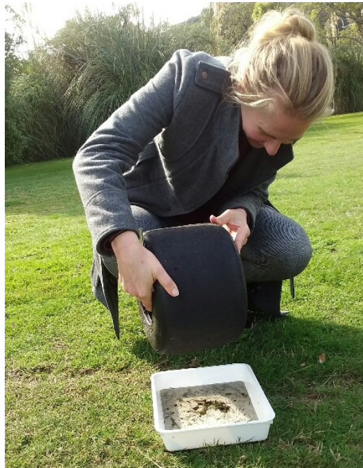
Figure 2) Emptying a tyre trap into a white container.