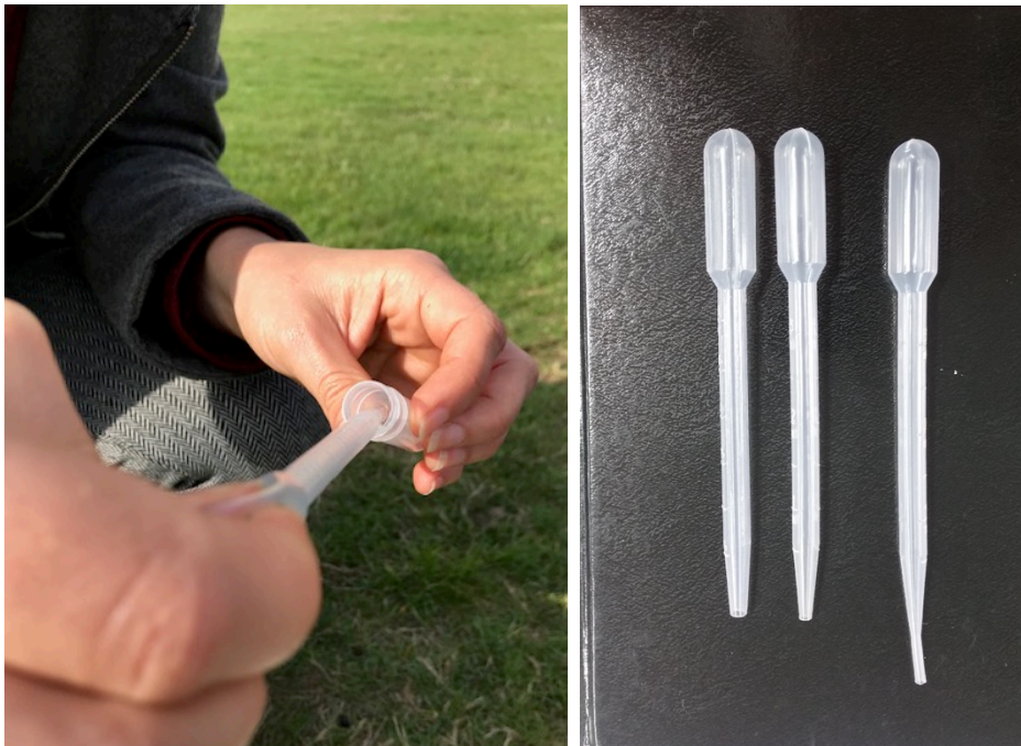
Figure 4a) Larvae are put into a standard sample tube. Removing excess water to allow more larvae to be added to the tube; b) plastic Pasteur pipettes with tips cut to various sizes.

Using a plastic Pasteur pipette, remove all the larvae from the tray into one standard sample tube (Figures 3 and 4). First instar larvae are very small and can be hard to see. It can be useful to look for their shadows on the base of the tray to spot them.