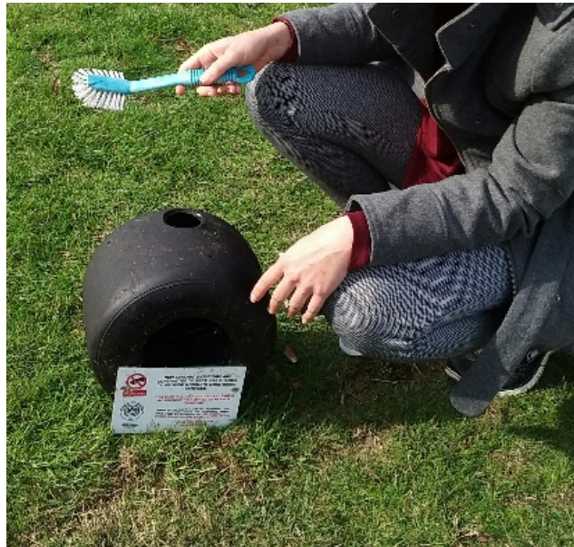
Figure 6) clean out the tyre when dirty.

NB: Do not scrub the tyre if it was negative AND the water is clear.