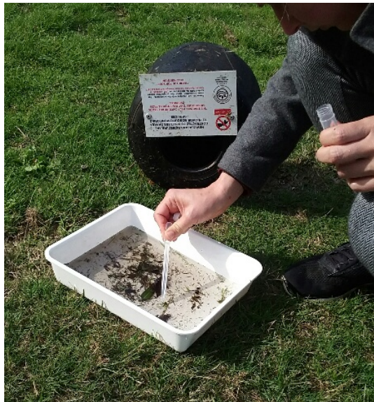
Figure 3) Use a plastic Pasteur pipette to remove larvae from tray.

Pour the entire contents of the tyre trap through the drainage hole of the tyre into a white tray, move your tray into a sunny or well illuminated spot, if there is not enough light use a torch (Figure 2). White trays will make it easier to spot larvae.