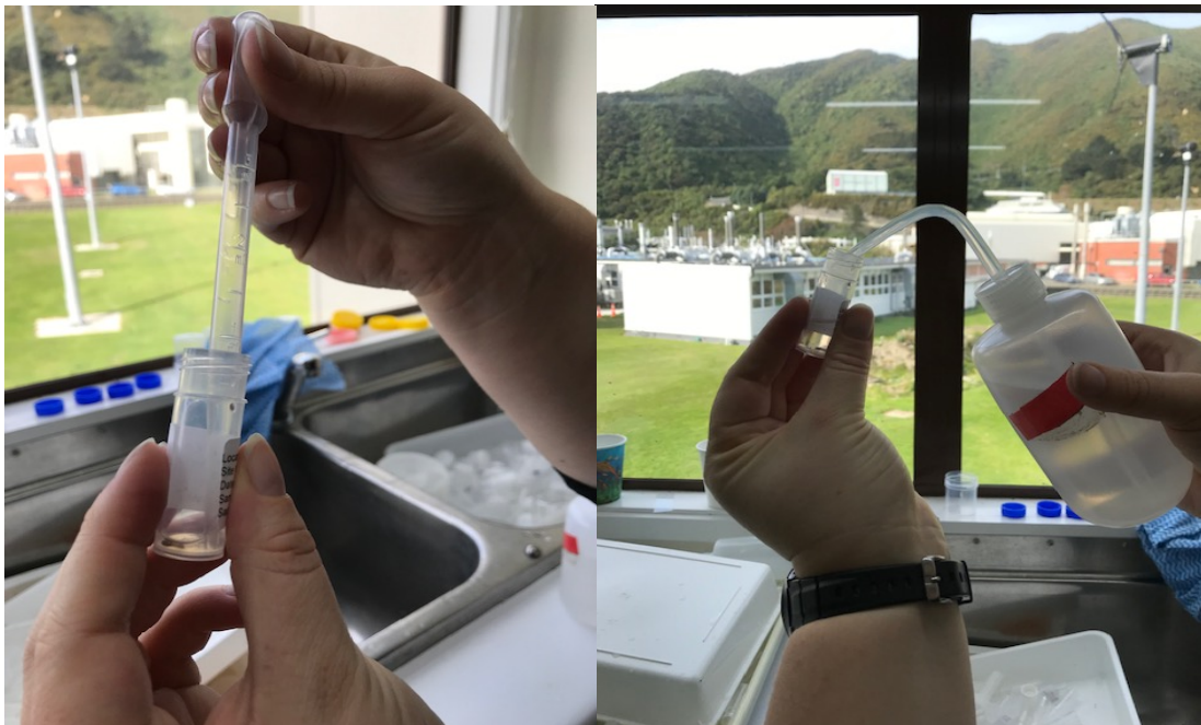
Figure 9a) remove as much water from the tube as possible; b) replacing water with 70% ethanol.

At the lab or office, empty as much of the water and debris from the tube as possible, (Figure 9a) and replace with at least 70% ethanol (Figure 9b). The ethanol should be filled to the lid of the tube to ensure that there is a sufficient amount to cover all the larvae and prevent them from drying out if the sample is tipped on its side during transport.